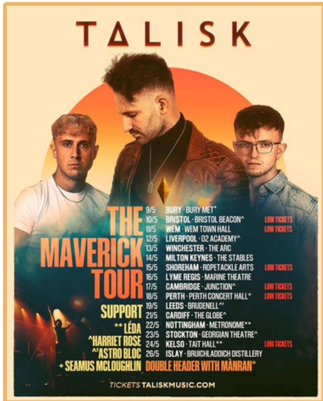
TALISK and Eddi Reader play in the Borders on their UK tours.

Events are promoted through our Live Borders App, with a reach of 15,000 and growing. In addition, we generate press activity (Life Magazines), website listings and a stream of social media activity.